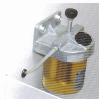
Centralised oiler for lubricating the cutting-head.