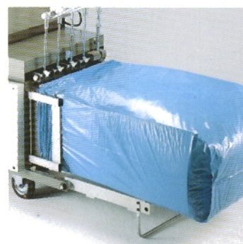
At the push of a button, the finished bale is quickly and cleanly ejected into a plastic bag.