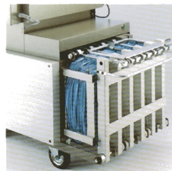
The sturdy press-chamber latch at the back of the machine.

The reliable machine which shreds and compacts: Document shredder with integrated baler.