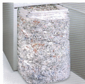
Pull-out bag frame for disposable plastic bags at the rear of the machine.

First choice where there are large quantities of documents to be destroyed, or when a central shredding installation is required. The large volume shredders from EBA.